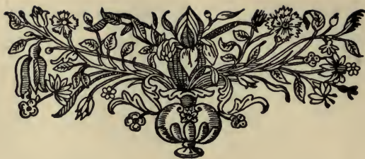
ILLUSTRATION TO VOL. LVI